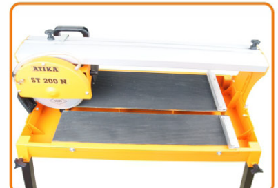
Table size 595 x 403 mm