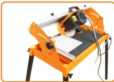
Swiveling cutting unit up to 45°