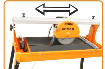
Max. cutting length 500 mm