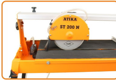
diamond blade Ø 200 mm