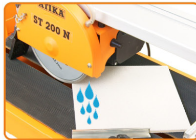
cooling water pump